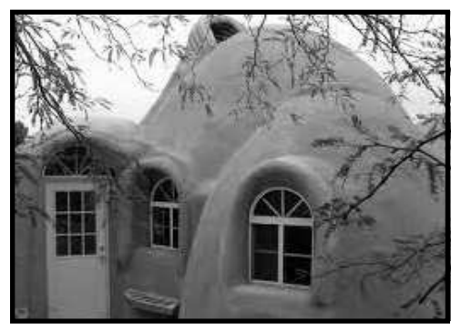
A finished superadobe home. An insulation of straw and then plaster are applied to the dome.

with Erik Ven who is building the first Las Vegas home. We hope to be the next. Erik has worked very hard with the city for over a year to get the building permit. Superadobe uses a lot of volunteer labor and the earth from the building site. Tubes of earth are coiled on barbed wire to form domes or vaults. We are at least sixmonths from construction.