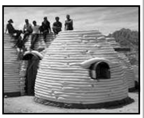
Laborers sit on top of a coil of superadobe tubes formed into a dome. Barbed wire holds each layer in place.

In July 2015, the City of Las Vegas became the first large city to issue a building permit for a superadobe home. The home will be built near Valley View and Charleston Blvd. We hope to build a superadobe "Hospitality House" for the homeless on the vacant lot behind the Catholic Worker home. We are working